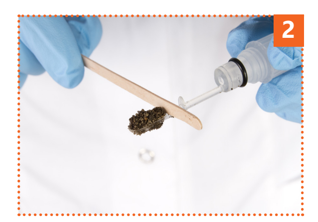
■ If faeces are solid, remove the excess amount using a spatula.