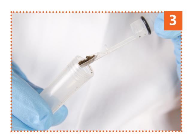
■ Dilute its content in the liquid of the small tube called sample tube.