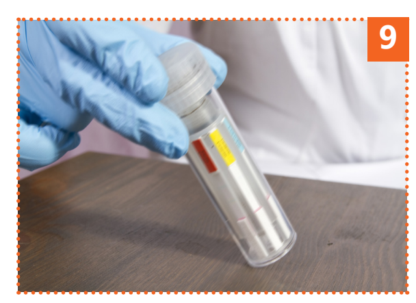
Sometimes, especially when the sample isn't homogenized, liquid migration can stop on one or more strips. In that case, tap the end of the strip tube on hard surface to allow migration to start again.