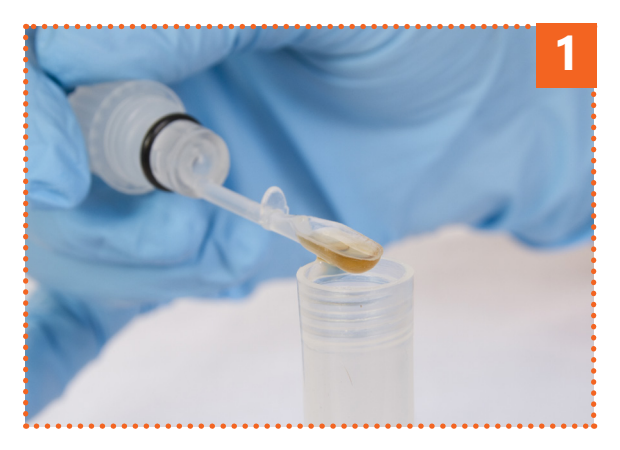
■ Take the faeces directly from the rectum of the calf. If the samples are liquid, take a spoonful.