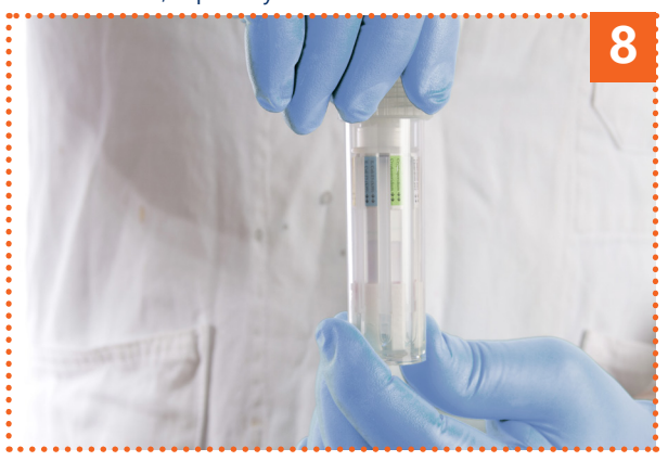
Screw the top of the strip tube.

You must hear two separate clicks, for perforation of superior and inferior septa of the sample tube.