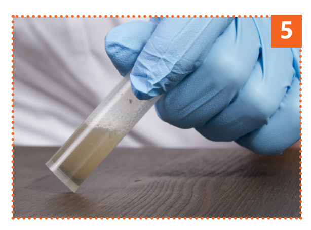
■ Tap the sample tube on a hard surface so that all the liquid is collected at the bottom of the tube.